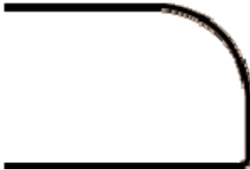
Name: Half Bullnose