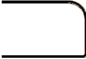
Name: 3/8" Round