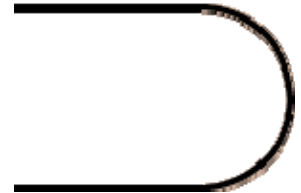
Name: Full Bullnose