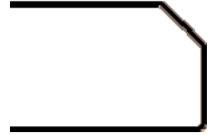
Name: 1/4" Bevel