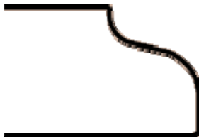
Name: Ogee Edge